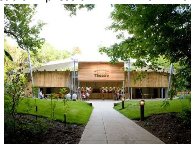
Kilworth House Theatre