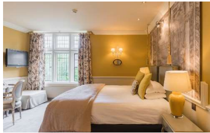
Coombe Abbey Bedroom