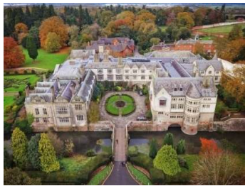
Coombe Abbey Hotel