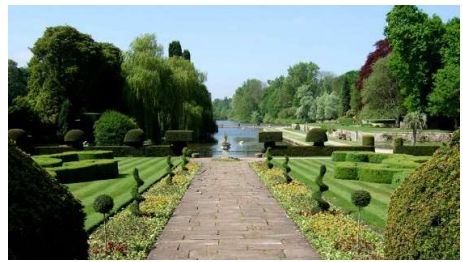
Coombe Abbey Gardens