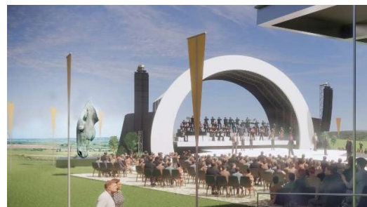
Nevill Holt outdoor Theatre image